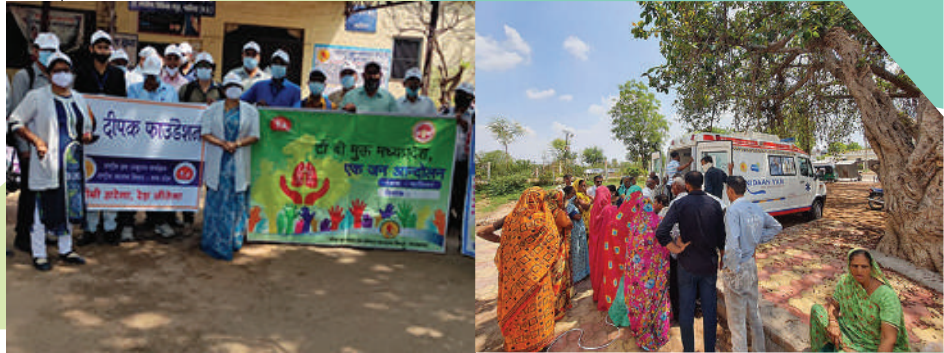
National Tuberculosis Elimination Programme (NTEP) & Nidaan Van