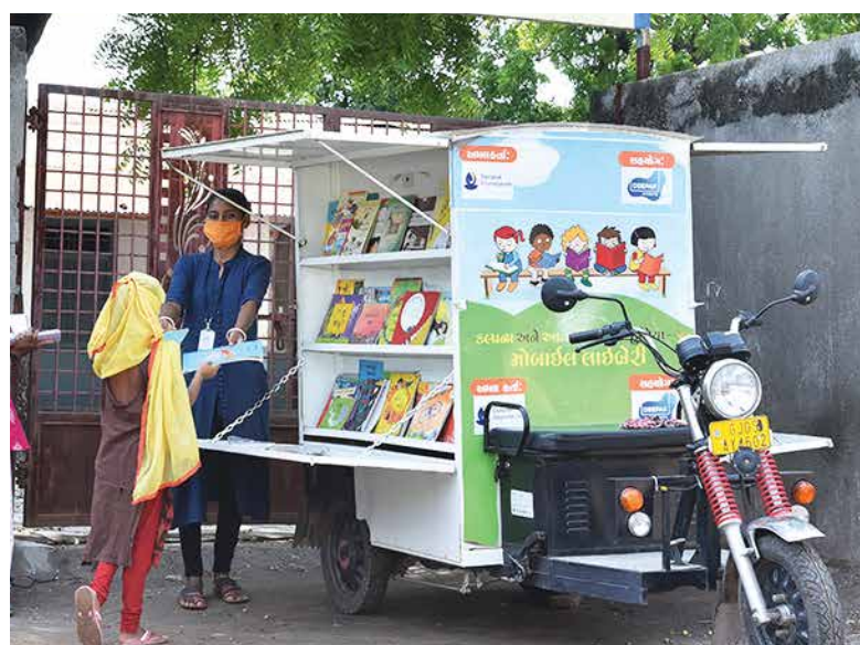
Books issued to children