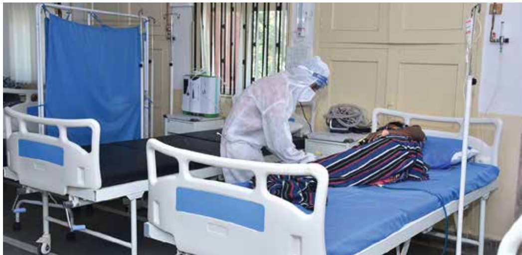
COVID Care Center was setup at Nandesari unit, Gujarat

With a surge in cases during the second wave of COVID-19 infections in April 2021, Deepak Foundation initiated COVID Care Centres at three locations, two in Gujarat & one in Maharashtra. As the deadly pandemic ravaged rural population, they had limited access to COVID care facilities. While the urban health infrastructure was chalk-a-block full with unavailability of ambulance services, the plight of patients from rural areas particularly those from poor communities was relatively worse than the urban community. The critical cases who rushed to the tertiary care facilities were left frantically looking for cost-effective options as the govt.'s free-of-cost facilities were already full. Considering the dearth of facilities in rural areas, Deepak Foundation initiated a multi-pronged relief measure to mitigate the impact of the second wave of the COVID-19 pandemic in partnership with Govt. and Corporate partners. Three different models of about 50 bed COVID Care Centers (CCC) were established w.e.f. April 2021 to address the need for hospital care. Two CCCs, one each in Vadodara district and Chhota Udepur district of Gujarat and one CCC in Palghar district of Maharashtra linked with mobile health unit were operationalized. The facilities have also been geared to promote vaccination among catchment population and supports in linking the govt.'s relief schemes and programs meant for eligible households.