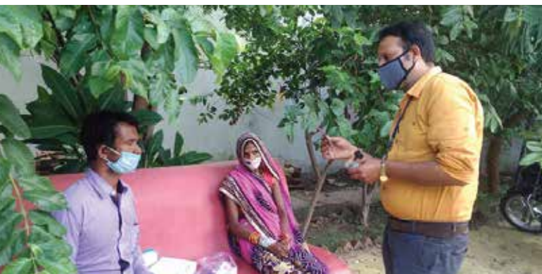
Fixed-drug combination delivery