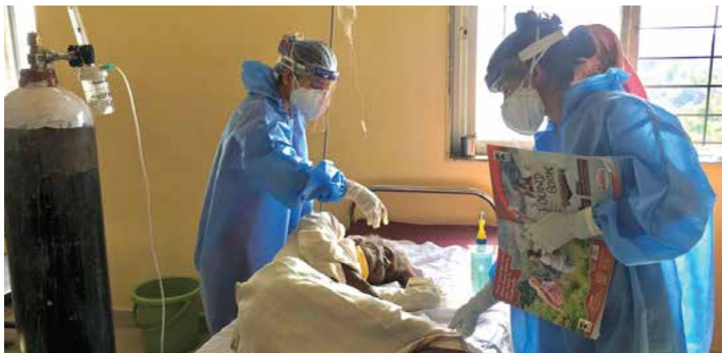
COVID Care Center was setup at Mokhada unit, Maharashtra