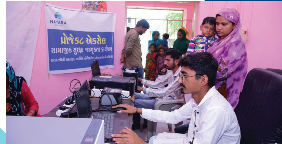
Facilitator providing scheme-related information to beneficiaries during yojana camp.