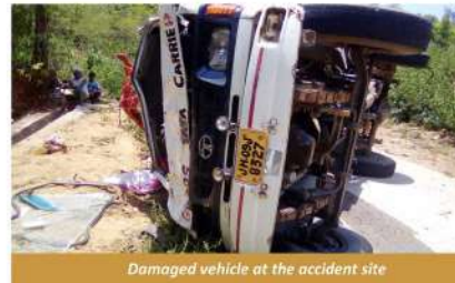
Damaged vehicle at the accident site