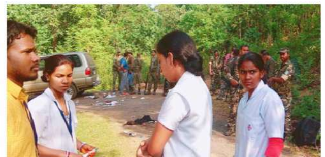
Medics team at the blast site

In the current edition, stories of change and impact from Pan-India are captured. We hope that the publication is informative and share glimpses of the activities undertaken by the Foundation. We will be delighted to receive your views and comments on this edition.