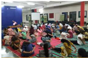
Deepak Foundation head office