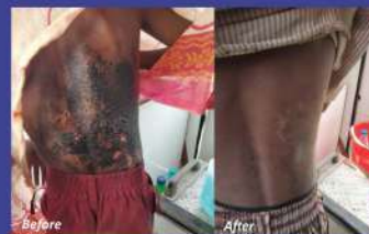
6-year-old receives treatment by staff of Mobile Health Unit, Kusavali, Talegaon, Maharashtra for burn injuries