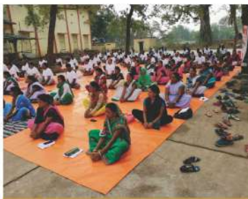
A healthcare unit at Dumri (Jharkhand)