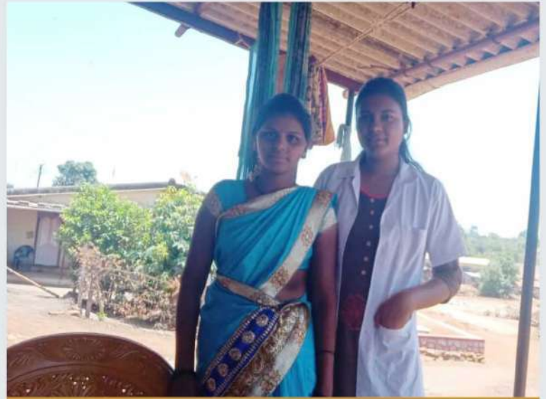
Patient visited by the doctor