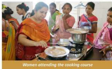
Women attending the cooking course

Deepak Foundation conducted a 2-day training program on June 25 and 26 for Farmers' Producing Company on financial compliance and responsibilities of board of directors, rules and regulations under the Companies' Act. On June 27, a cooking course was also organized for the women of Self Help Group (SHG), Jabugam for creating income generating opportunities in tribal areas.