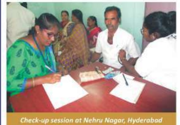
Check-up session at Nehru Nagar, Hyderabad