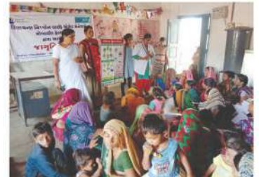
ASHA workers conducting the awareness session at Ucheda village