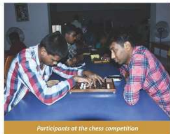
Participants at the chess competition