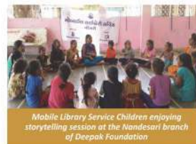
Mobile Library Service Children enjoying storytelling session at the Nandesari branch of Deepak Foundation

Nandesari's library project aims at improving reading skills among children aged (6-14) years. Storytellers conducted a myriad of storytelling sessions on the theme of environment. This included storytelling session and discussion on "Magic fish", a story about dolphin named Ira from Chilika, Orissa. Children became aware about fish, water cycle and the need to conserve forests.