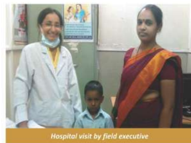
Hospital visit by field executive