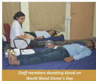
Staff members donating blood on World Blood Donor's Day