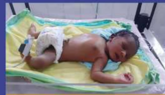
New-born under critical care

A new born baby, diagnosed with Encephalitis was hospitalized at FRU Dumri, Giridih district of Jharkhand. The pediatrician provided immediate treatment to the case. He also provided counselling to the mother for post discharge care.