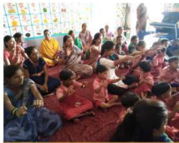
INA MHU Schaeffler Talegaon (Maharashtra)