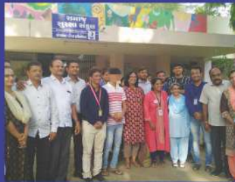
Child with foster parents, Deepak Foundation team and district level government officials.

Finding foster parents for children at Child Care Institution is a challenge in India. Samaj Suraksha Sankul, a Public Private Partnership initiative of Deepak Foundation facilitated a child from CCI in a foster care family on June 14, 2019. Government officials and staff of the Foundation were present during the proceedings to encourage the foster parents and the child.