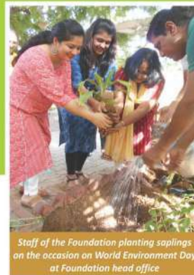
Staff of the Foundation planting saplings on the occasion on World Environment Day at Foundation head office