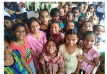
Children at the Asoj village in Savli block health camp