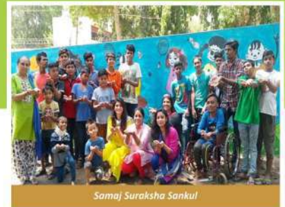
Samaj Suraksha Sankul

On June 5, 2019 World Environment Day was celebrated by planting saplings at various locations of Deepak Foundation.